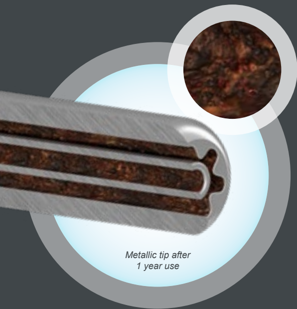
Metallic tip after 1 year use

It is impossible to clean correctly the inside of reusable tips due to the presence of biofilm. (1)